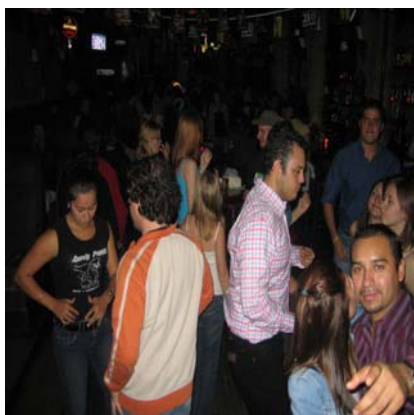
Raving it up at the Anza Club.