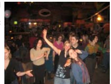
Squamish March 11th, 2006

the beautiful local people and our music. After the break we went back on stage, and they were right on the floor from the first song. Afterwards, everyone was talking to us and asking when we were coming back.