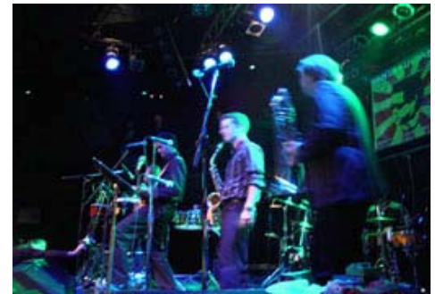
Richards on Richards Oct 8 th , 2005

Want to receive this newsletter once a month? Sign up the mailing list on our website